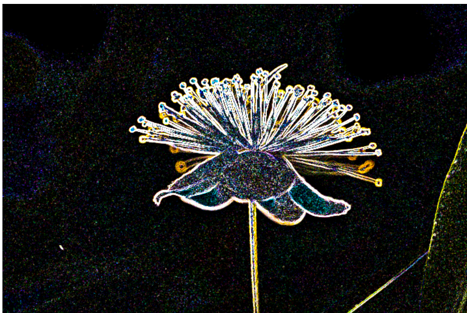
myrte.féérique - fairy myrtle

Perhaps you would like to create your personalized perfume with the incredible scents that nature offers and at the same time enjoy the blessing that plants provide. More than 300 fragrances are available: flowers, wood, herbs, berries, fruits .... to create the fragrance that suits you. ( more information )